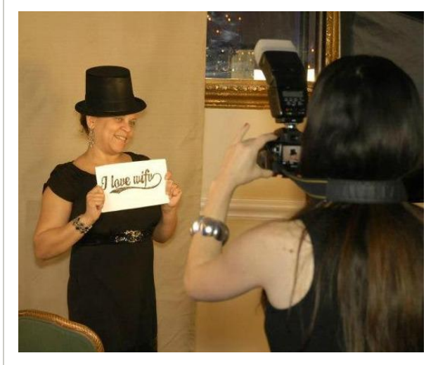
Readying the Photo Booth at Women of Vision Awards! You can see a range of photos at sharypic.com/wiftisummit

high school students. It was created in 1997 to teach local youth about film and video production, while also helping deserving nonprofit organizations. Image Makers participants learn how to research, write, produce, direct and edit a 30-second public service announcement (PSA) for broadcast distribution. These PSAs are made for up to three deserving nonprofit organizations each year. Students, Nonprofit Organizations and WIFV members are encouraged to apply. Applications are available here.