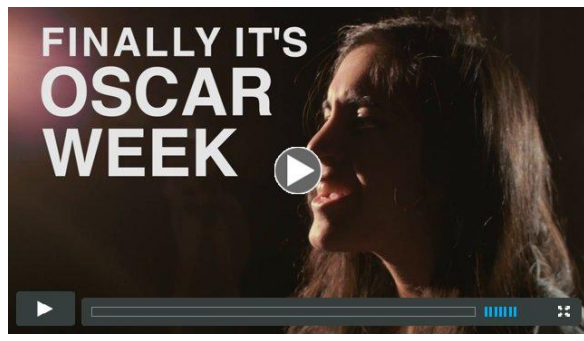
BLANK SLATE (Blank Space Oscars 2015 Commentary)

Women's History Month? Join us at the WIFTI Shorts-case on March 8; contribute to the $35 for 31 Women Campaign; watch women-made films; make progress on your own projects!