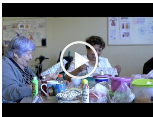
Hermanas Mayores: Nunca Muy Gris/ Senior Sisters, Never Too Grey