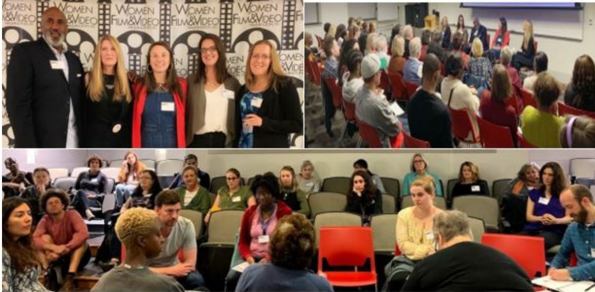
Row 1 - 40th Anniversary Disrupter/Seed & Spark panelists and panel; Row 2 - Darling Directing Master Class

ScriptDC would not have been possible without the support of School of Communications American University , OCTFME , Maryland Film Office , Interface Media Group , Roadmap Writers , and the GemStar Foundation.