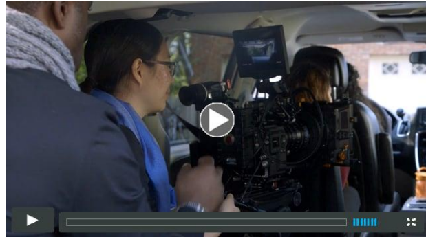
Behind the Scenes of the Mason Film Lab: THE PICK