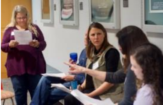
Directing Master Class Rehearsal