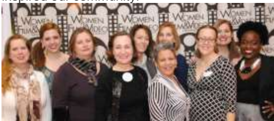
Members of WIFV Board!