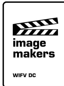
Image Makers '14 Underway