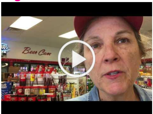
America: Summer 2016: What's Going On?