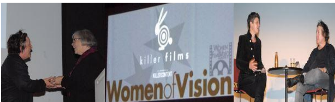
L - Vachon receiving award from Houghton; R - Chesler and Vachon

Event sponsors included GMU Film and Media Studies, Film and Video Studies, Photography, Women and Gender Studies, and Women in Film & Video. The program is also supported by GMU Cultural Studies and the GMU English Department.