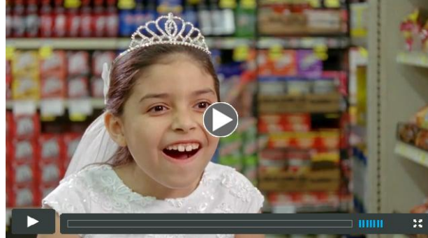
THESE COLORS DON'T RUN Trailer

What's the best way to brag about your accomplishments? With a Members in the News article, of course. Not only can you include a photo and your website, it is archived at wifv.org and adds to your SEO. Submit your paragraph, jpg photo, and any links to director@wifv.org by the 10th of the month.