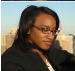
A big welcome to our two new WIFV Interns: