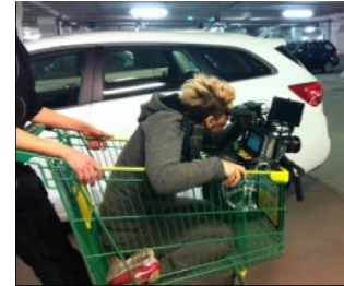
DOP Sari Aaltonen

I realized the lack of men in the crew only on the set, so we were not intentionally favoring women in recruiting. We chose our best and closest colleagues and they happened to be women!