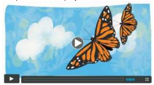
Life Stories:One Story Monarch Butterfly

and is building a team of educators and scientists to help advance the project.