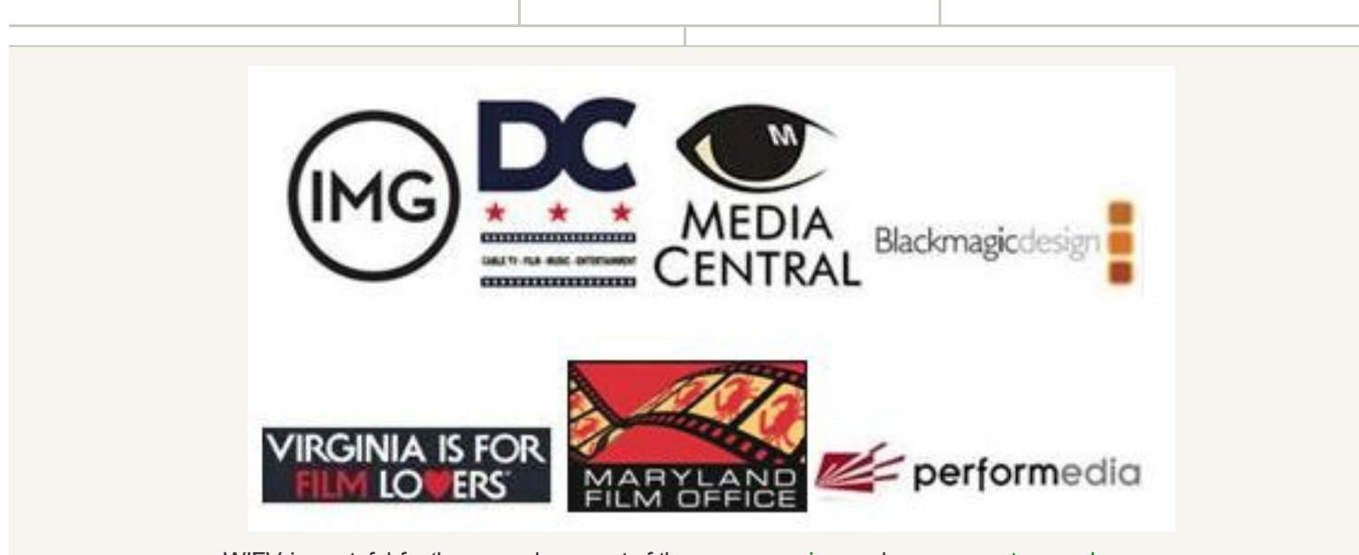
WIFV is grateful for the annual support of these <u>companies</u> and our <u>corporate members</u>.

Just a reminder that you're receiving this email because you have expressed an interest in Women in Film & Video. Don't forget to add director@wifv.org to your address book so we'll be sure to land in your inbox!