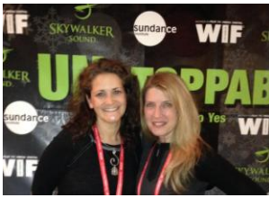
Essenmacher & Skyrme

was happy to bump into DC's own casting power house and