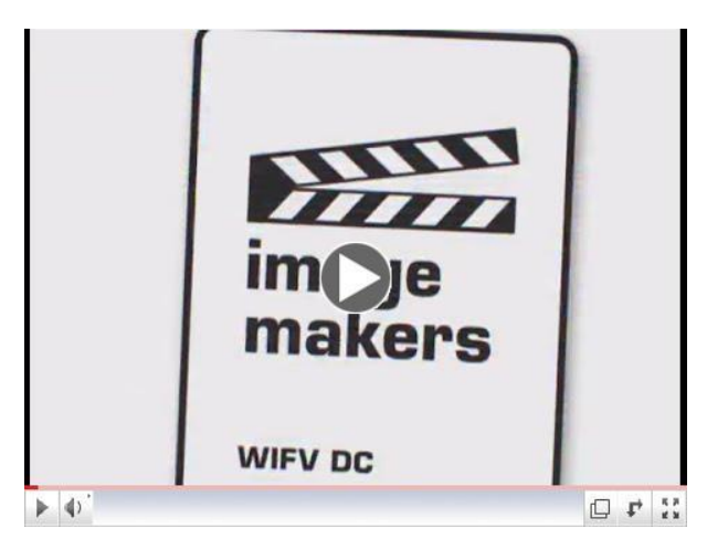
What is Image Makers?

Deadline to participate in this year's program is December 15 - applications here.