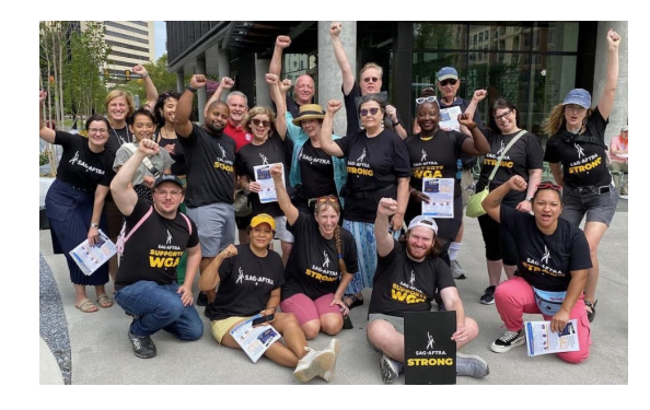
SAG-AFTRA Support in NYC

We welcome receiving photos of you at work - writing, filming, acting, and supporting colleagues. Send your photos to director@wifv.org. Please provide a project name and a photo credit.